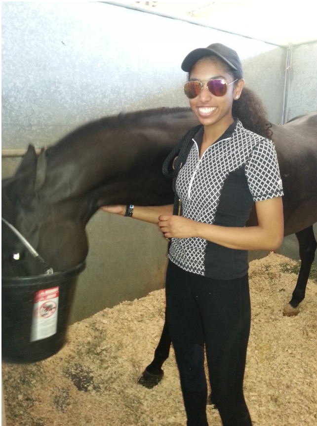
More Horse Expo;