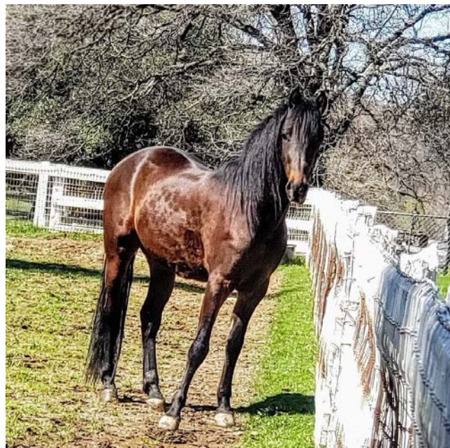
LSW Dirty Little Secret

LSW Dirty Little Secret is returning to Grand Finale Stables to compete in his 4-year-old year in Western Dressage with a goal of competing in the 2020 Grand National show!"