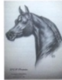
UVM Promise (14)