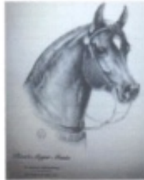
Rex's Major Monte (15)