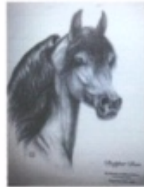
Dapper Dan (0)