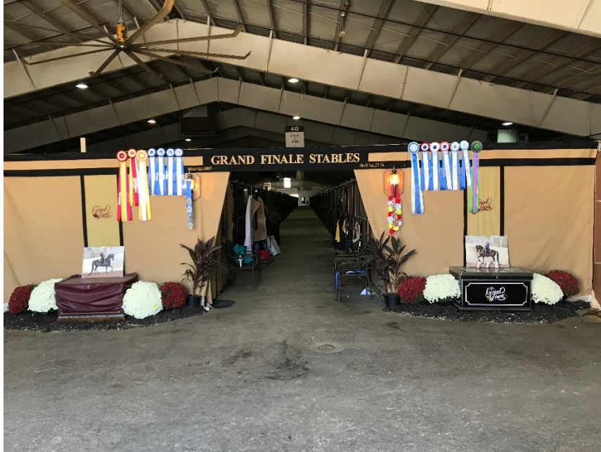
Grand Finale Stables' ribbon collection at the Grand National

HD Redford won the Grand National FEI Grand Prix, Grand National FEI Intermediate II, Grand National Amateur 3 rd level western dressage test 2, Grand National Amateur 3 rd level western dressage test 4.