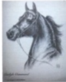
Carlyle Command (11)

Proceeds to benefit the Morgan Horse Ranch at Point Reyes National Seashore (a 501(c)(3) nonprofit organization)