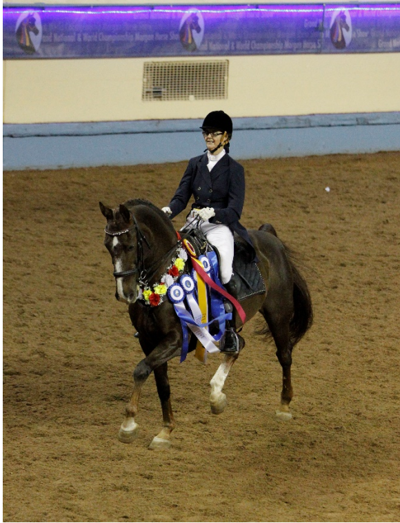
HD Redford with all his ribbons