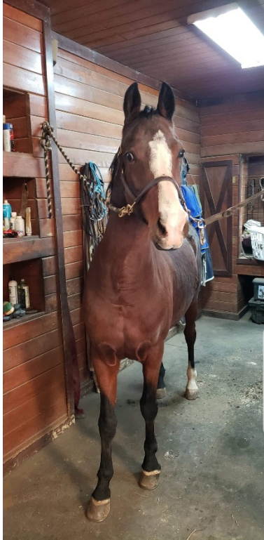
SDMF Déjà vu Nights

"I have the winning bid on Graycliff Tony from the WMF Stallion auction held at the Grand National this year! SDMF Déjà Vu Nights ("Cookie") will be bred in 2021 for an amazing baby! Cedar Creek La De Da will be also bred in 2021 to The Optimist. Once confirmed in foal, both babies will be available to purchase in utero!