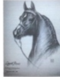
Lippitt Pecos (1)