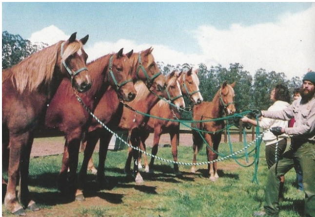
Archive photo of Point Reyes Morgans

Dedication of the Morgan Horse Ranch (MHR) took place on June 27, 1970 on the historic Bear Valley Ranch. Seventy-plus Morgans were born at the MHR with the Los Reyes prefix between 1970 and 1999. The Morgans were born on the Ranch, trained on the Ranch and transferred out to other parks for use in their programs. The first Morgan donated was Rhed's Felinity in foal with Los Reyes Locura. The last Morgan born at the MHR was Los Reyes Abrams (Elvis) and he is still alive and being used as a mounted patrol horse and for special community events.