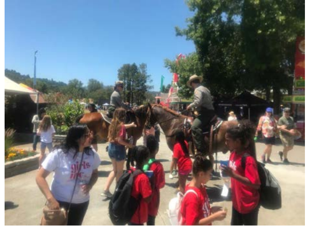
Morgan horses at the Marin County Fair

*Assisted Project Hope in relocating their veteran's therapeutic program to a more compatible facility in accordance with written Memorandum Of Understanding.