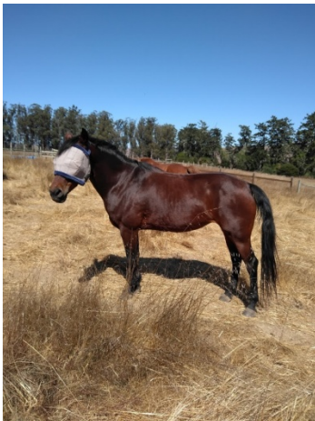
Mira (left) and Stardust (right)

*Evaluated two local 11 year old Morgan mares offered for adoption, signed donation contracts for 90 day trial periods (one returned to donor and one contract extended for second 90 day trial period). Mira (bay) and Stardust (chestnut).