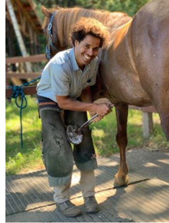
MHR staff working with the horses

*Ensured that existing Los Reyes Morgans (Rose, Elvis, Honcho and Buck) are handled and trained every day to get them fit for duty.